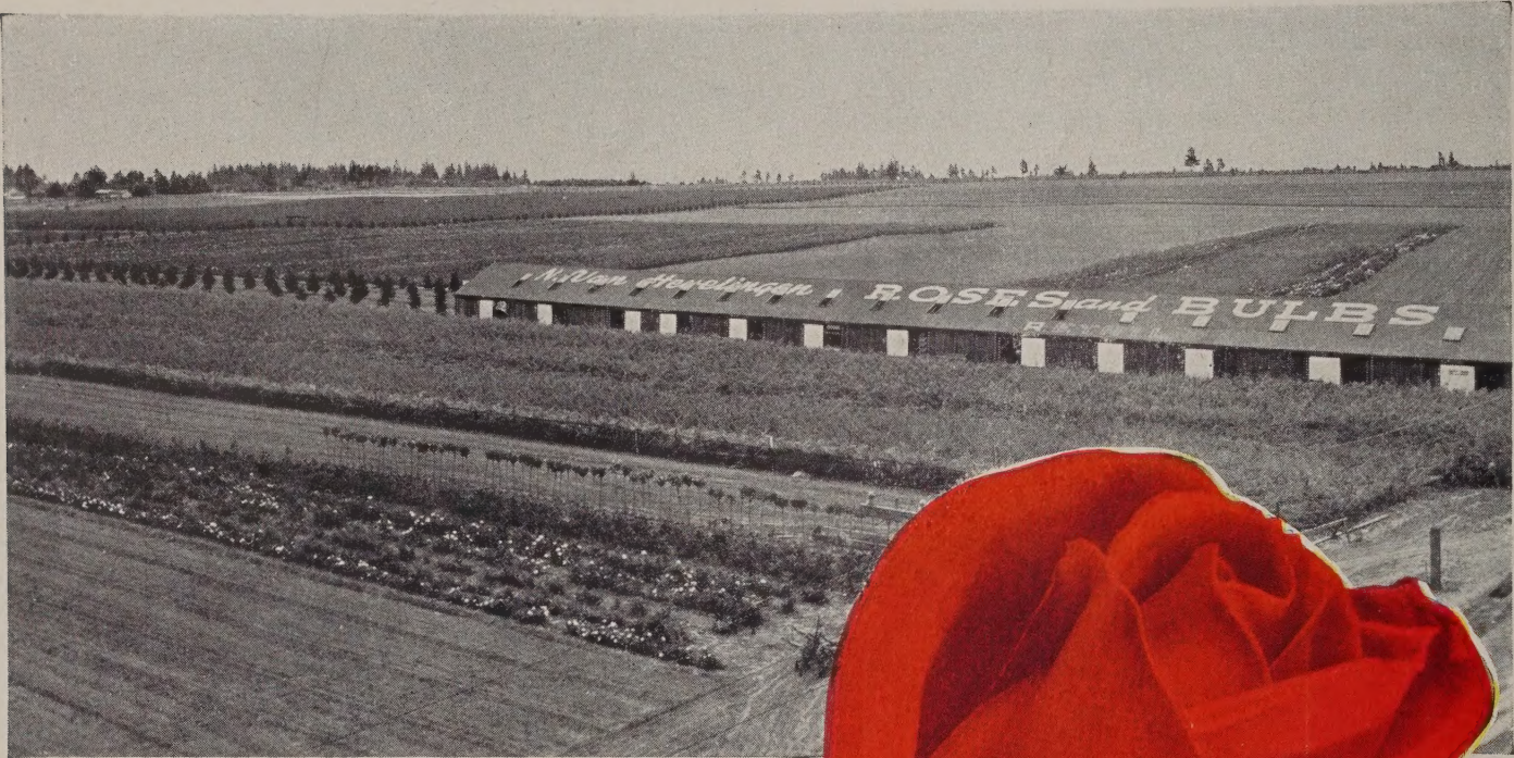
Packing House and partial view of our 50 acres of Roses on our 180-acre Nursery, located conveniently 8 miles east of Portland on the scenic Columbia River Highway.